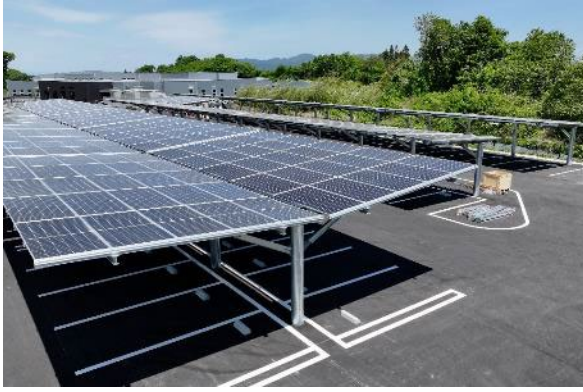
Solar Photovoltaic Carports